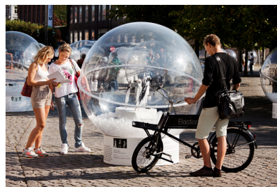
INDEX: Award 2009 Exhibition

WASARA is an INDEX: Award finalist because it truly offers the best in biodegradable, disposable tableware with its pure and elegant Japanese design. It is made entirely from tree-free renewable resources using materials such as sugar cane fibers, bamboo and reed pulps. And it is also praised for the design of one-of-a-kind Japanese spirit. While it is by design ephemeral, it represents the essence of Japanese tradition.